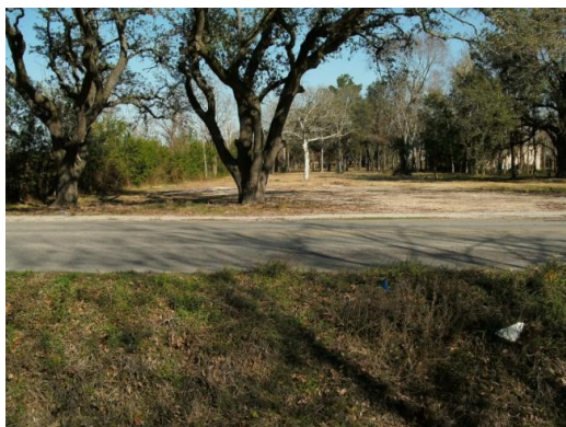
Hunter Park – September 2012