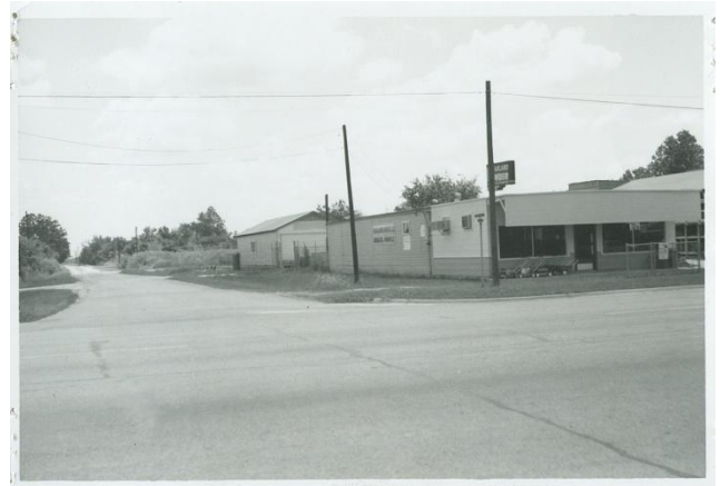
Pearland Lumber when it was on the south side of Orange. Picture taken on Main St. looking east on Orange.

What is really nice about Pearland Lumber is you can walk in looking for a 1/2" screw 2" long or something similar and there will be someone right there who will take you back and find it for you. Congratulations to the Loessin family.