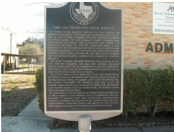
Texas Historical Marker at Old High School

The tour will start in Alvin at the old Aldridge Smith House and will include the Alvin Train Depot, the Schuster House and the old Pearland High School . The tour group is