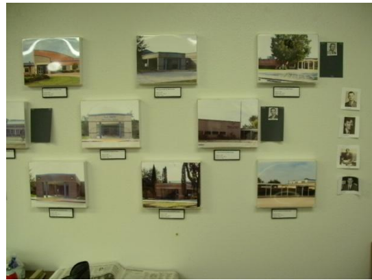
A pictorial history of the growth of the Pearland Independent School District on east wall.