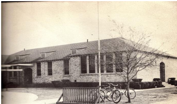
Old Pearland High School

The old 1937 Pearland High School will be part of the Brazoria County Historical Museum’s tour of historic structures May 18 th .