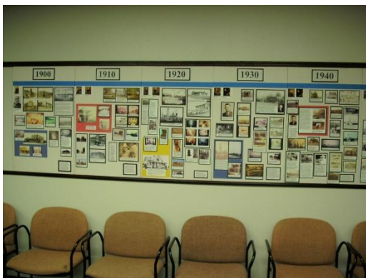
Timeline pictorial history of Pearland by the decades on west wall.