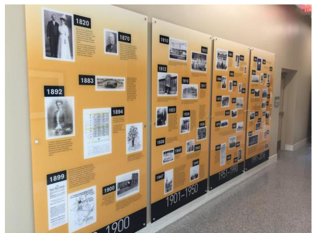
This picture shows the complete timeline. As you can see it is a very large timeline.