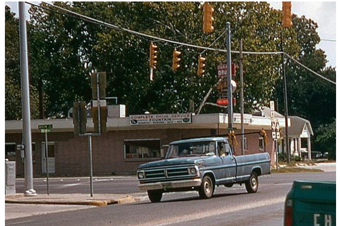
Old Corner Drugstore, corner of 518 and 35.